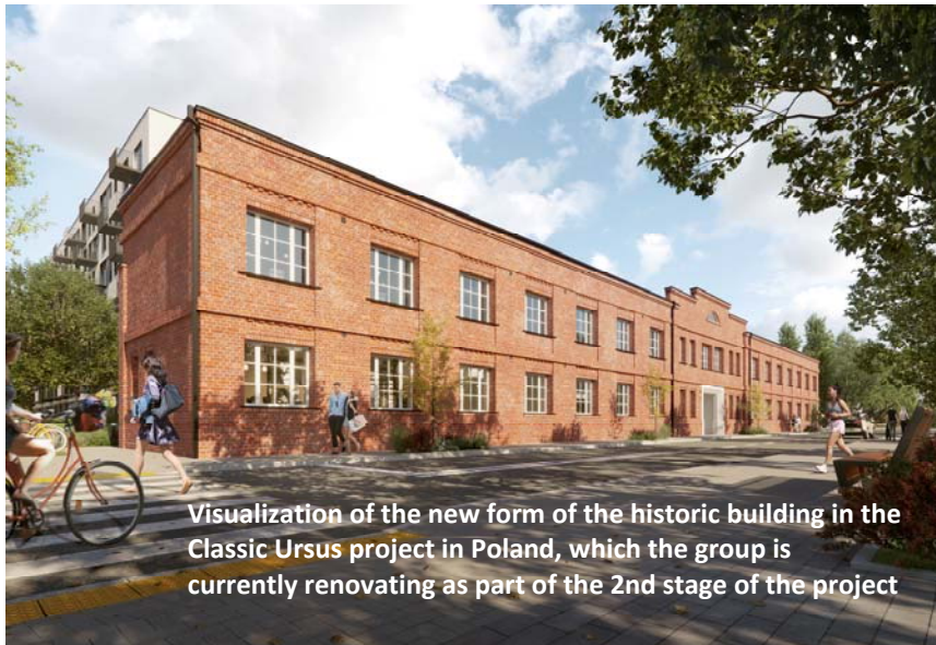
Visualization of the new form of the historic building in the Classic Ursus project in Poland, which the group is currently renovating as part of the 2nd stage of the project

Prague, May 15, 2024 – The international developer UDI Group opened a fund of qualified investors. It will make it possible to invest in czech and foreign development projects. It is intended for private and institutional investors. It offers an appreciation of up to 15 percent. The resources obtained from investors will be used for the construction of specific prepared projects as well as for financing the development of the group.